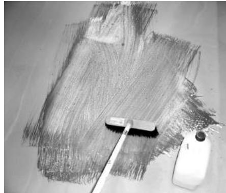
Applying primer with a push-broom onto a concrete surface.

Puddles are brushed out and the surface allowed to dry before application of the levelling cement.